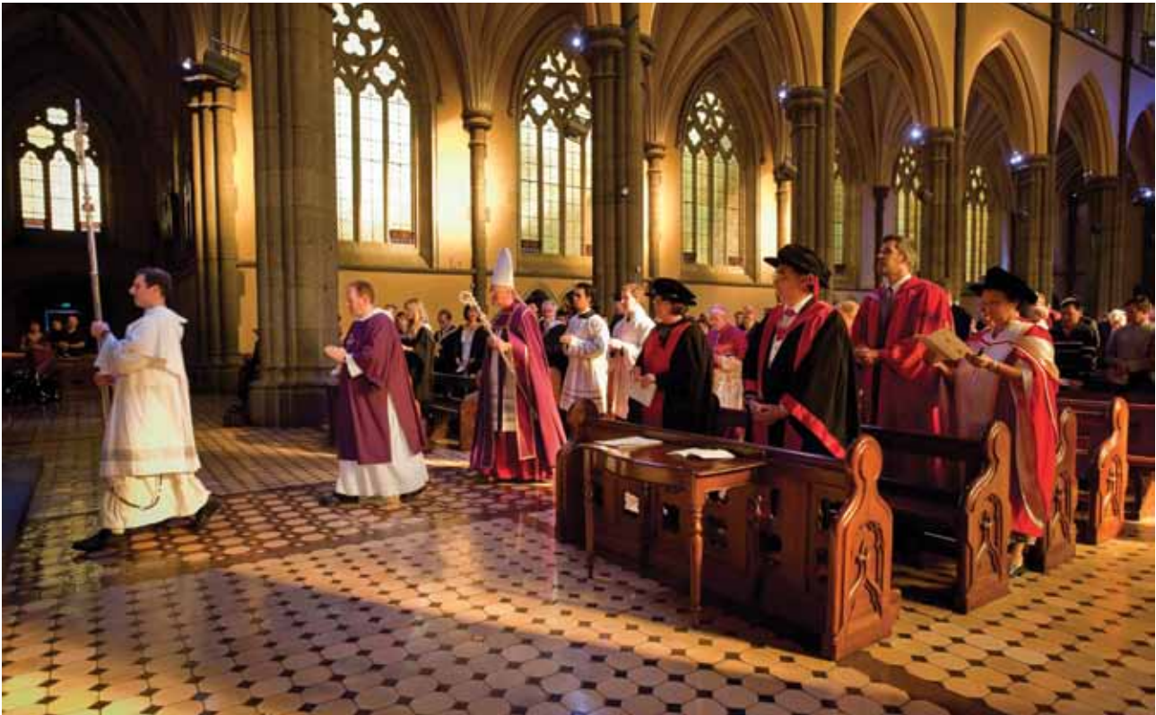
Graduation Ceremony with Archbishop Hart in St Patrick's Cathedral, 2010