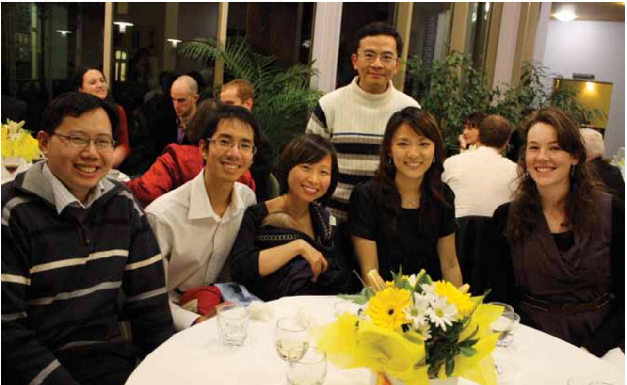
John Paul II Institute Students at the 2010 Academic Dinner.

October 9 2010 participated in Roundtable Consultation with Australian Human Rights Commission on GLBTI discrimination and vilification issues.