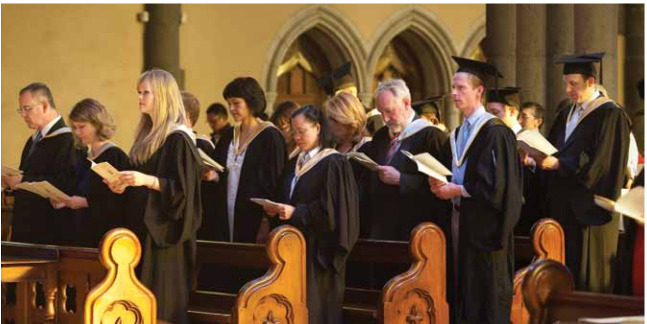
Graduation Vespers 2010 at St Patrick's Cathedral

University of Melbourne Bachelor of Veterinary Science, Lecture on Religious Attitudes to Reproductive Technology to third year students. August 2010