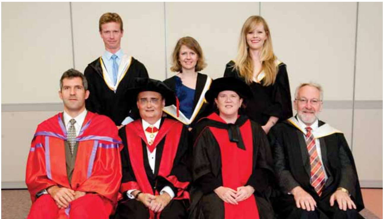
Bioethics Graduates with Faculty, Graduation Day 2010.