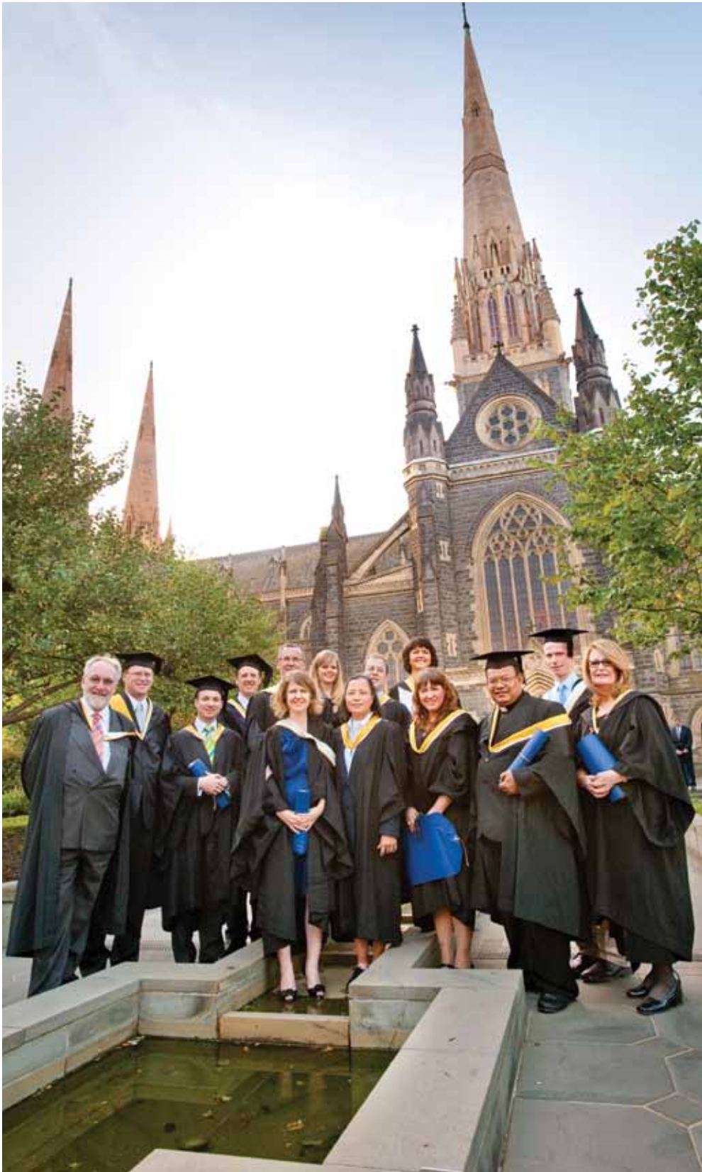
John Paul II Institute Graduates outside St Patrick's Cathedral, Melbourne, Graduation Day 2010.